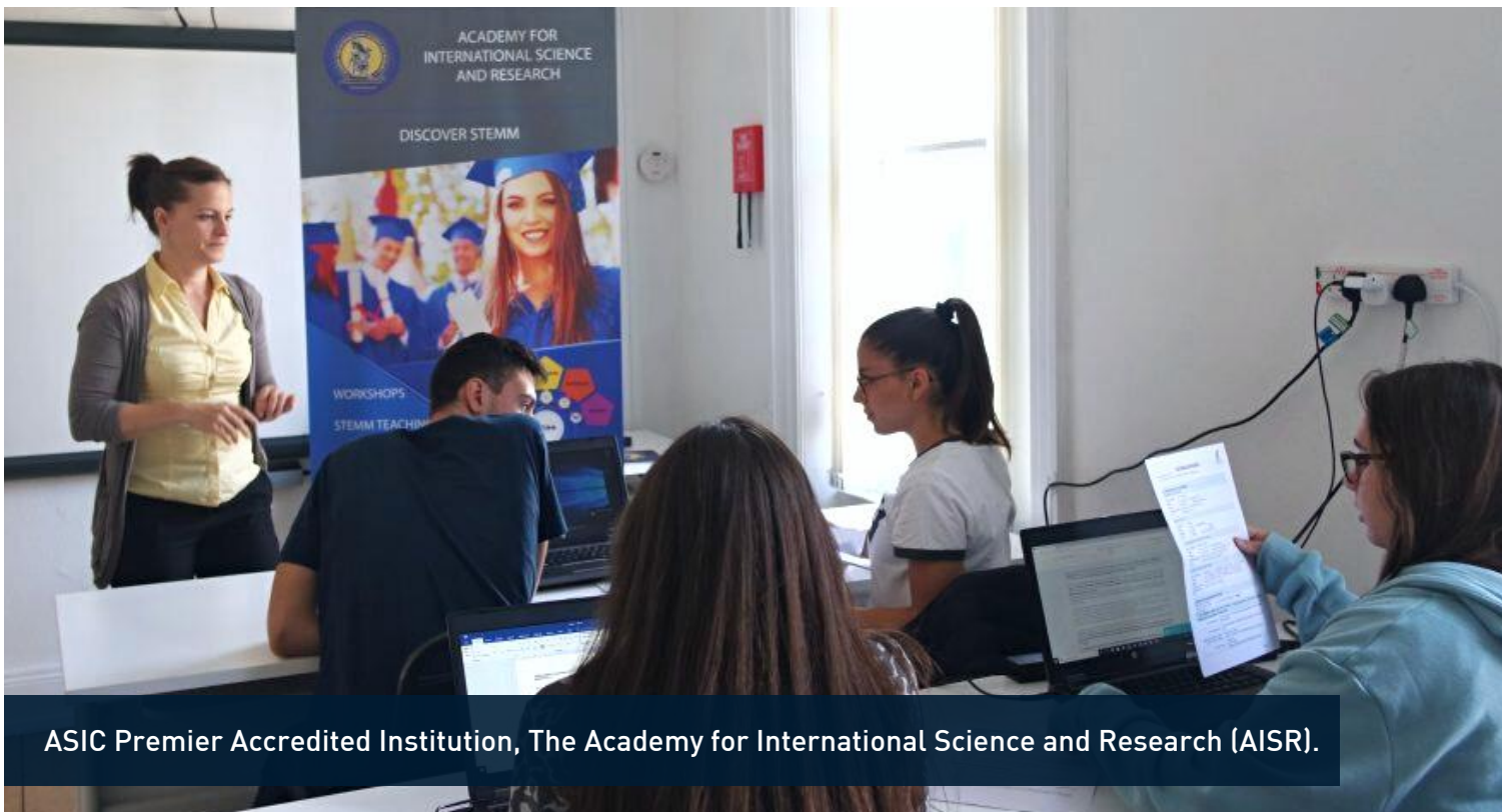
ASIC Premier Accredited Institution, The Academy for International Science and Research (AISR).