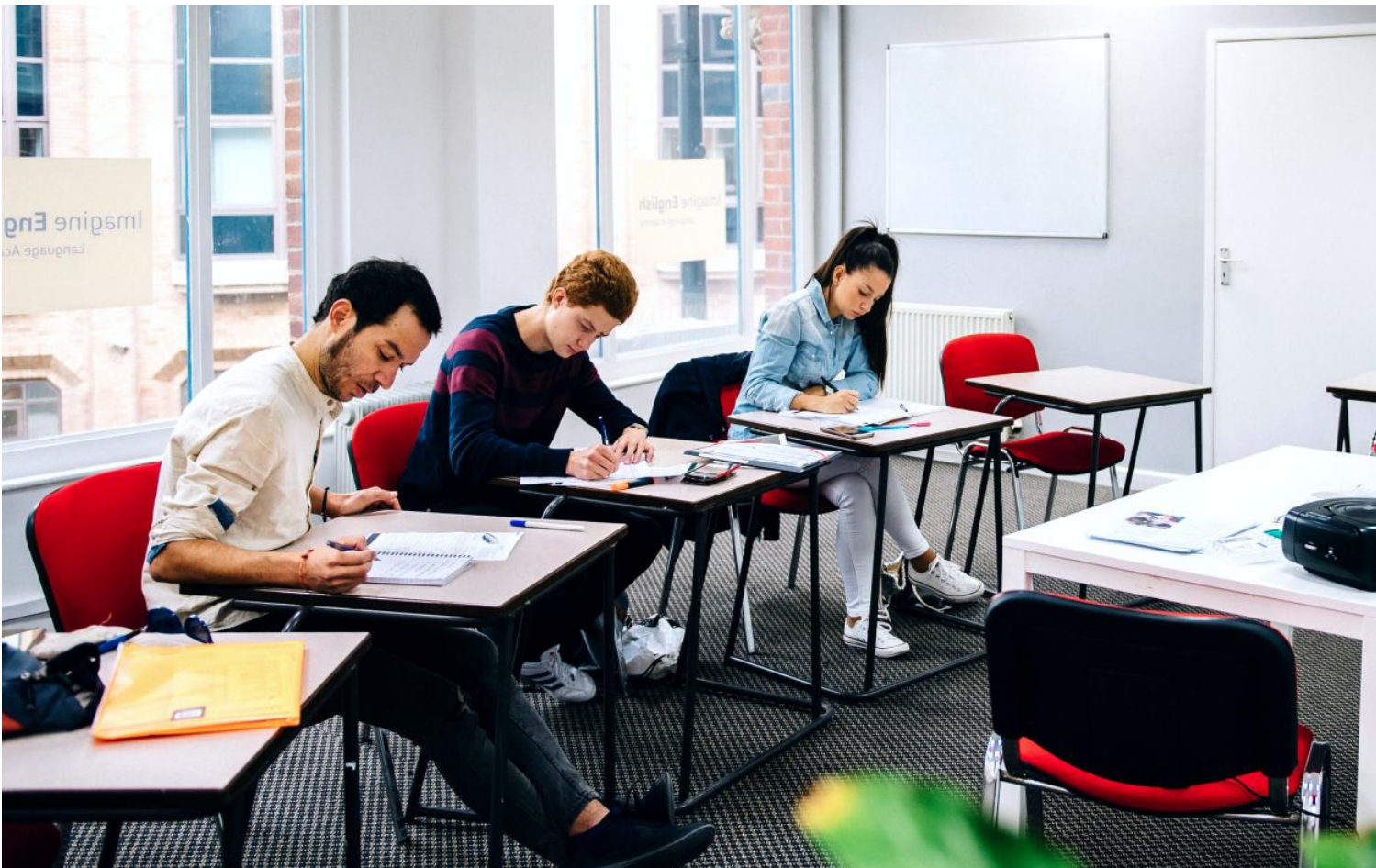
Classroom of ASIC Accredited Institution, Imagine English.

Decision: The process leading to the award of Accreditation for a new institution is as outlined in Section 2.3.2. , and all applicable Fees are in the Finance Policy ( Appendix B ). The Stage 3 Inspection will occur during the Interim Period, once the institution has informed ASIC that the recruitment of students has been successful and classes have begun. When the institution has demonstrated that its full range of provision meets the required standards, the AAC will award full Accreditation, again, as described above in Section 2.3.3.