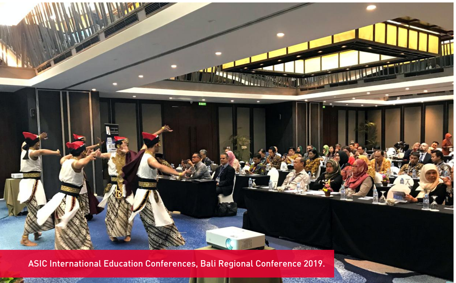
ASIC International Education Conferences, Bali Regional Conference 2019.

Opportunities to further develop your provision are available through supplementary services, e.g. ASIC International Education Conferences and ACS Consultancy (see ASIC website for more). Additional fees will apply to use these services, but we endeavour to offer priority access or provide discounts and other options exclusive to our accredited institutions.