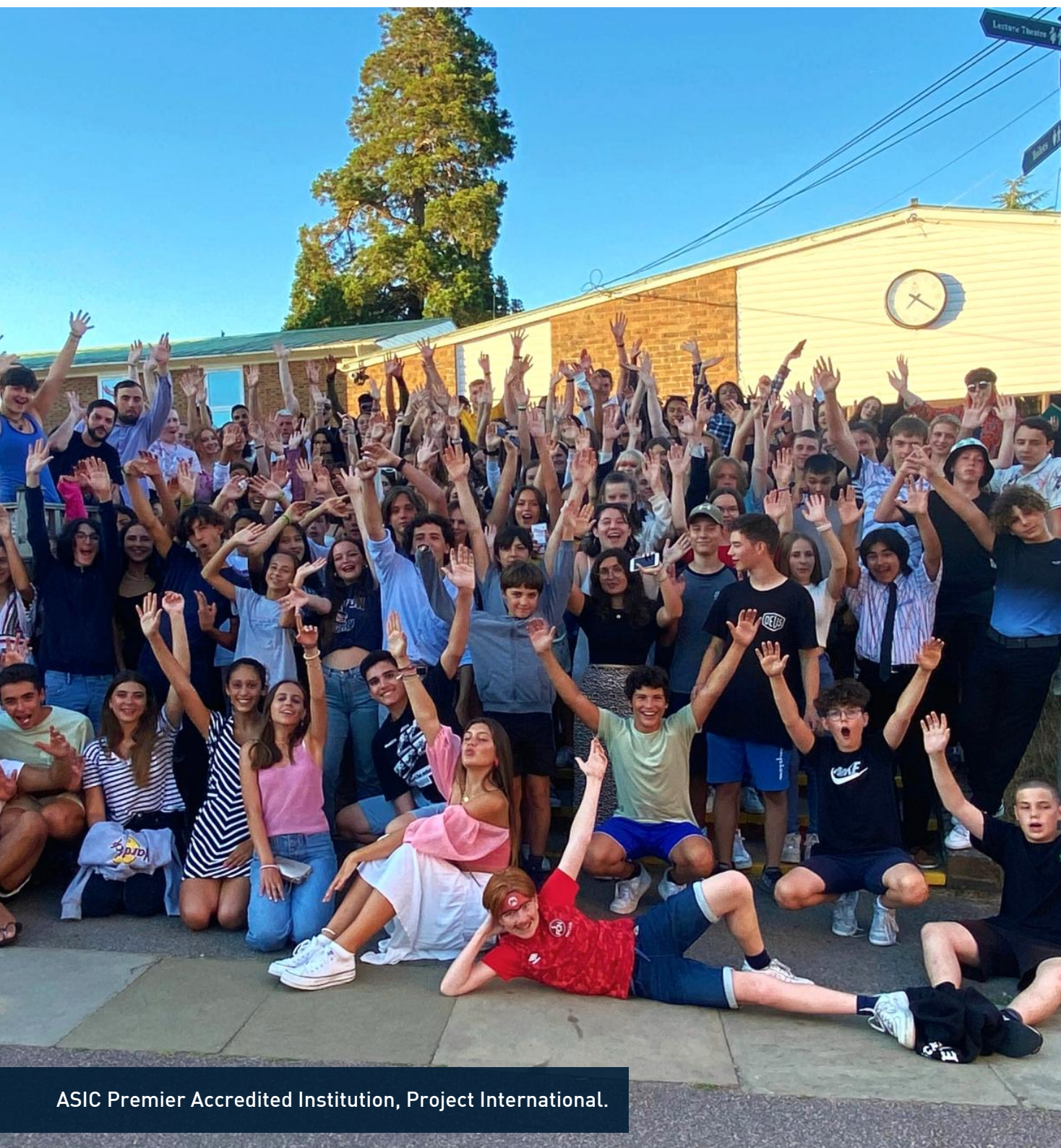
ASIC Premier Accredited Institution, Project International.

ASIC reserves the right to amend its services, processes, and all associated fees at any point as deemed necessary. Changes to accreditation fees and all other associated fees will be communicated to existing ASIC institutions via email and updates to the Finance Policy.